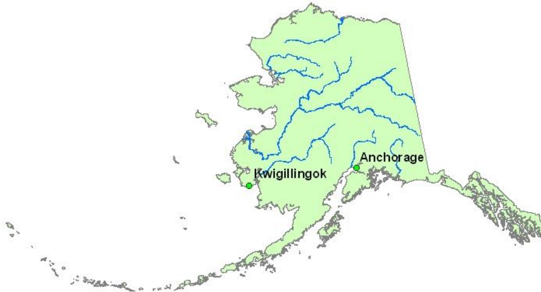
Figure 1: Kwigillingok Location & Vicinity Map